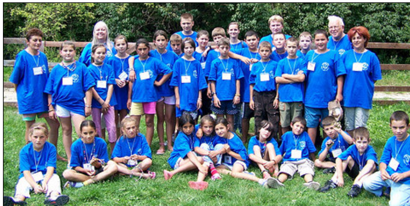
The all-camp photo.

All three of us from the United States shared the feeling that the benefits we received from the experience were at least as equal to, if not greater than, the benefits that the children received. ●●