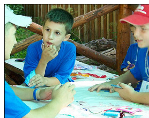
A card game