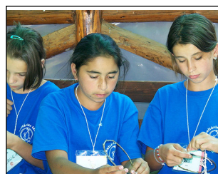
A craft project